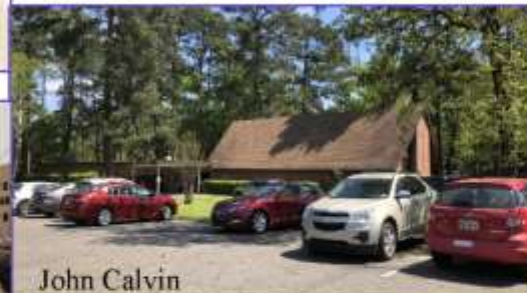
John Calvin Presbyterian assisted Saint Stephen.